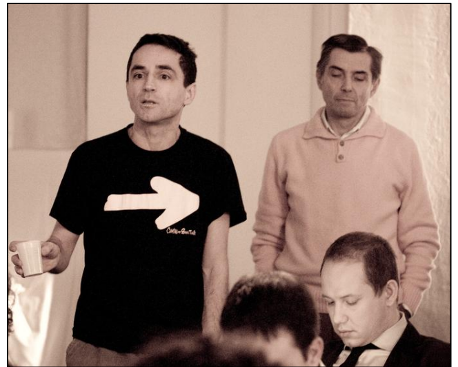
1 – “There's Your Expert”

Social strategies for boosting site rank can significantly benefit from having others doing the work for you. Create incentives that engage and entice customers, employees and business partners to generate unique content. Images and snapshots work well. They're easy to take and upload with the hyper-ubiquity of phone cameras. Create an easy way for users to upload and share their images of them doing stuff with your product to your site. Free and cheap examples include promoting a Twitter hash tag for user photos or encouraging photo sharing via Facebook and your company tag. More advanced examples include soliciting customer or partner photos uploaded to your website. Then have a gallery where users can view their pictures and those of others. Yes, make sure you have someone responsible for curating those photos. That is simple common sense.